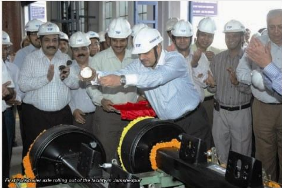
First York trailer axle rolling out of the facility in Jamshedpur

York Transport Equipment (India) (YTEI), a subsidiary of TRF, launched its first axle from its manufacturing facility located in TRF's premises in Jamshedpur. In view of the growing demand for trailers and the need to be close to the rapidly growing customer base in India, the York Group, a subsidiary of TRF, since October 2007, has set up YTEI.